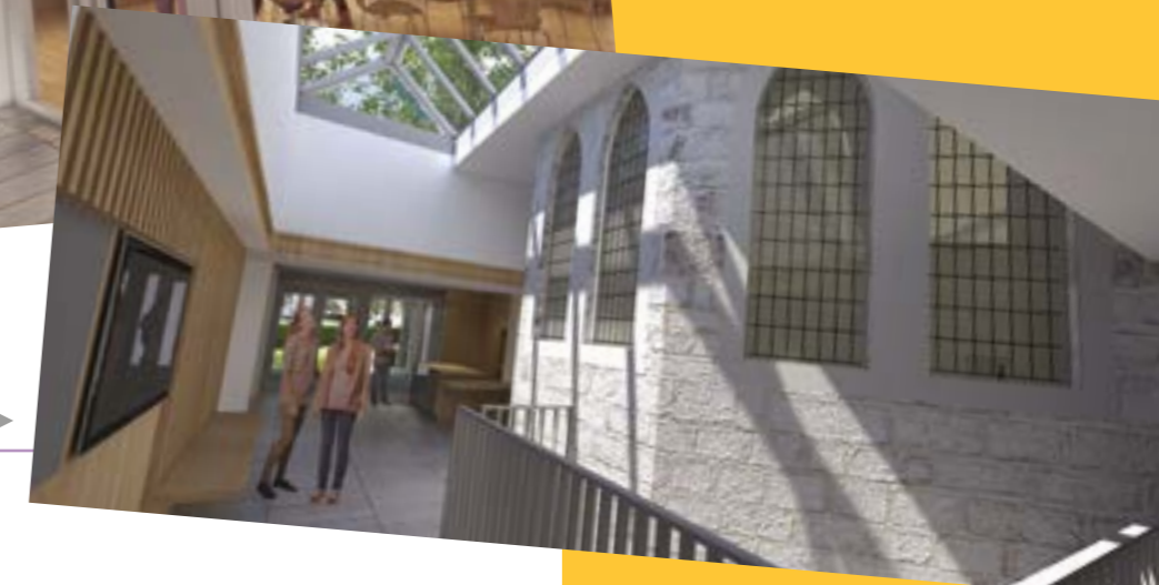
Future Atrium ►