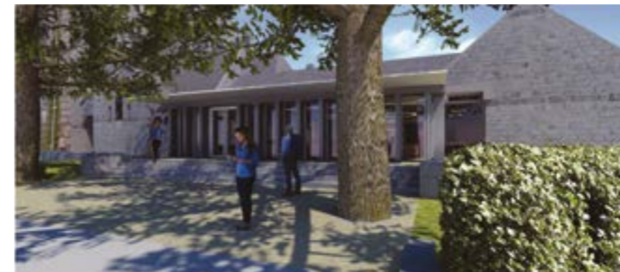
Future Main Entrance ▲

We are in the early stages of progressing our plans and gathering the necessary resources to make our dream a reality. We'll keep you up to date with the progress!