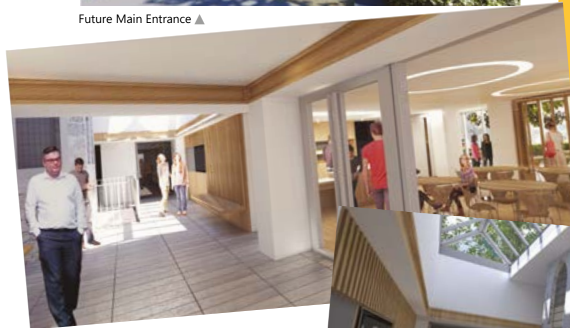
Future Main Entrance / Foyer ▲